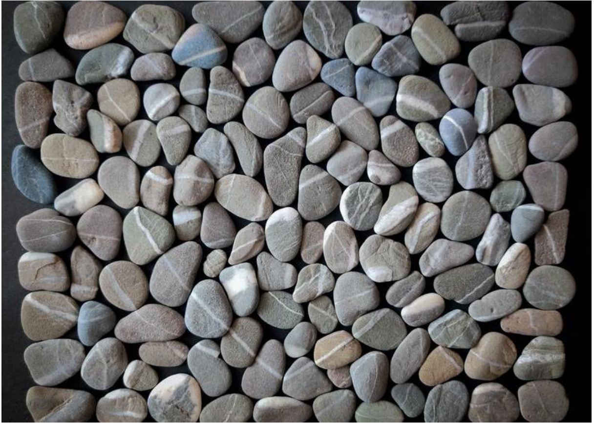
Cardboard roll with rock picture glued on.